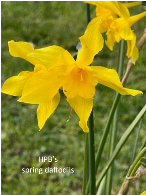
HPB's spring daffodils

“If I had a flower for every time I thought of you, I could walk in my garden forever.”